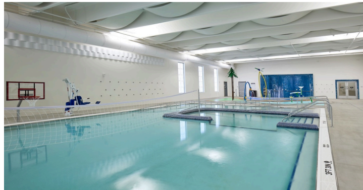
The pool in the Cambria Recreation Center at Camp Courage

At the heart of the facility is an ADA-accessible aquatic center spanning more than 8,000 square feet, featuring a temperature-controlled, zero-entry pool, and a 12,900-square-foot gymnasium with a stage for performing arts and a climbing wall.