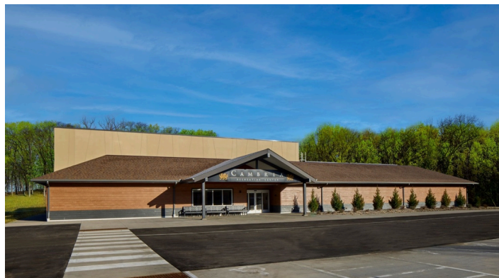
The new Cambria Recreation Center at Camp Courage

Additionally, Cambria's "Built for More" video further captures the spirit and dedication behind this world-class facility.