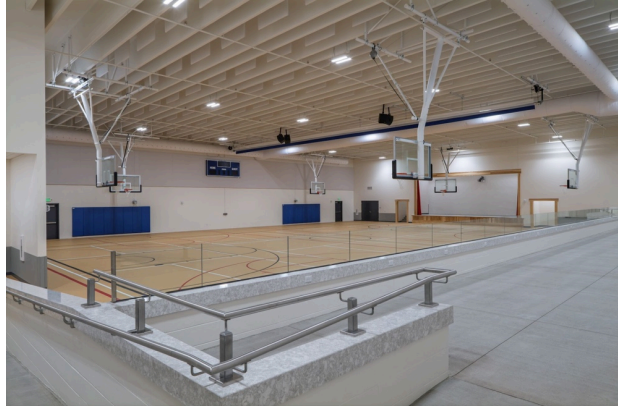
The gymnasium in the Cambria Recreation Center

of True Friends. “We are deeply grateful to Cambria and the Camp Cambria® Foundation for helping make this vision a reality.”