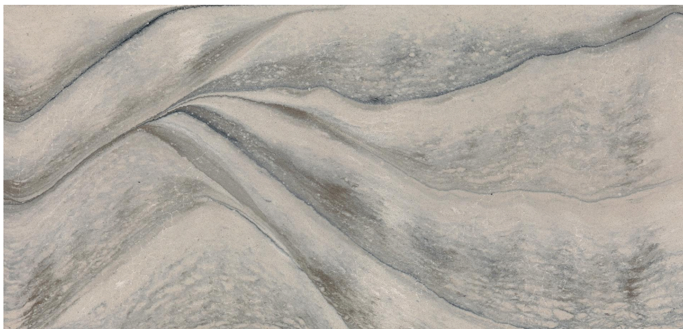
Cambria design shown: St. Isley

St. Isley™: For those ready to make a statement, St. Isley is unapologetically bold. Dynamic waves of blue-gray veining intertwine with warm taupes and dark grounding accents, creating a design that feels confident, artistic, and alive. Whether used as a dramatic island, a focal-point fireplace wall, or a luxe commercial interior, it offers motion, contrast, and undeniable presence. Finish options: Polished and Cambria Satin