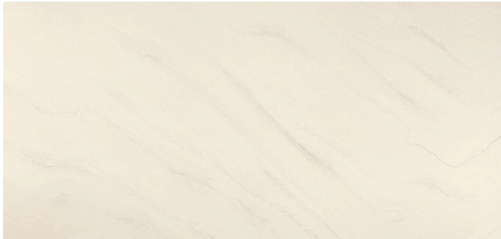
Cambria design shown: Kenwood

Kenwood™: Understated yet unforgettable, Kenwood is a masterclass in restraint. A creamy canvas is delicately layered with diagonal taupe veining and white crackles, offering a sense of movement without overwhelming. Inspired by organic form and timeless architecture, it pairs effortlessly with natural woods, brushed brass, or woven textures—ideal for spa baths, serene kitchens, or boutique retail. Finish options: Polished and Cambria Satin™