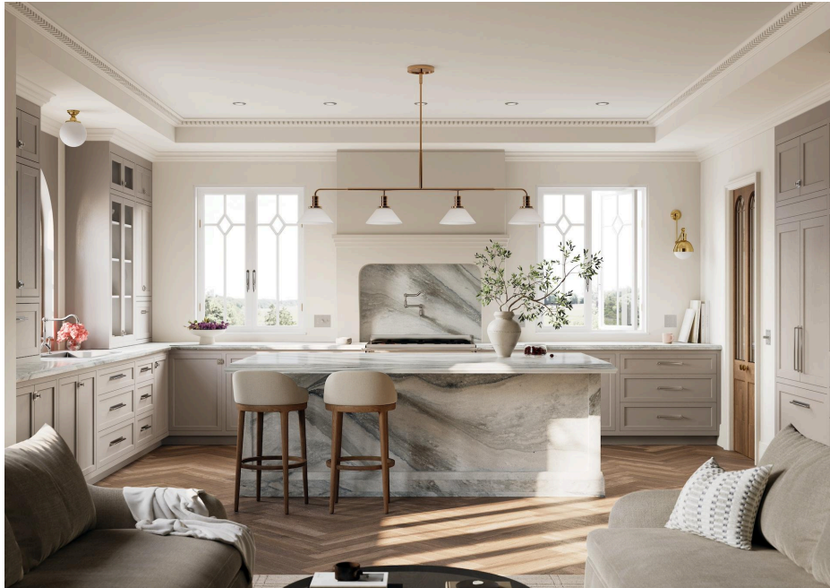
Cambria design shown: St. Isley

This new launch signals a continued evolution in Cambria's design philosophy—one where emotional connection, natural inspiration, and quiet innovation converge. It arrives at a moment when homeowners are craving warmth, organic depth, and texture in their spaces. From restorative neutrals to expressive veining, each surface is designed to reflect not only how people want their homes to look, but how they want to feel in them. An escape within.