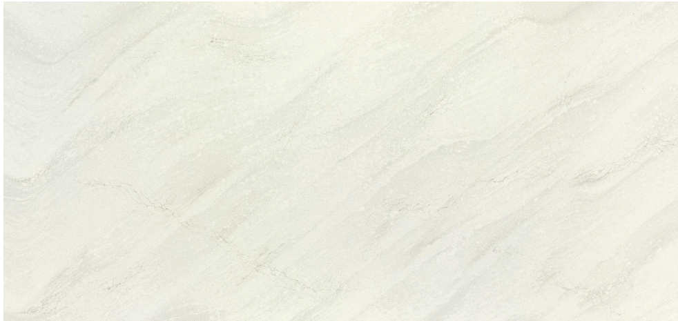
Cambria design shown: Traymore Bay

Traymore Bay™: Inspired by beach sand, sun-faded shells, and flowing tide lines, Traymore Bay channels coastal serenity through gentle, diagonal veining and warm-toned movement. Its soft and subtle palette of taupes, ivories, and misty neutrals brings peace to kitchens, bathrooms, and hospitality spaces alike. Finish options: Polished and Cambria Satin™