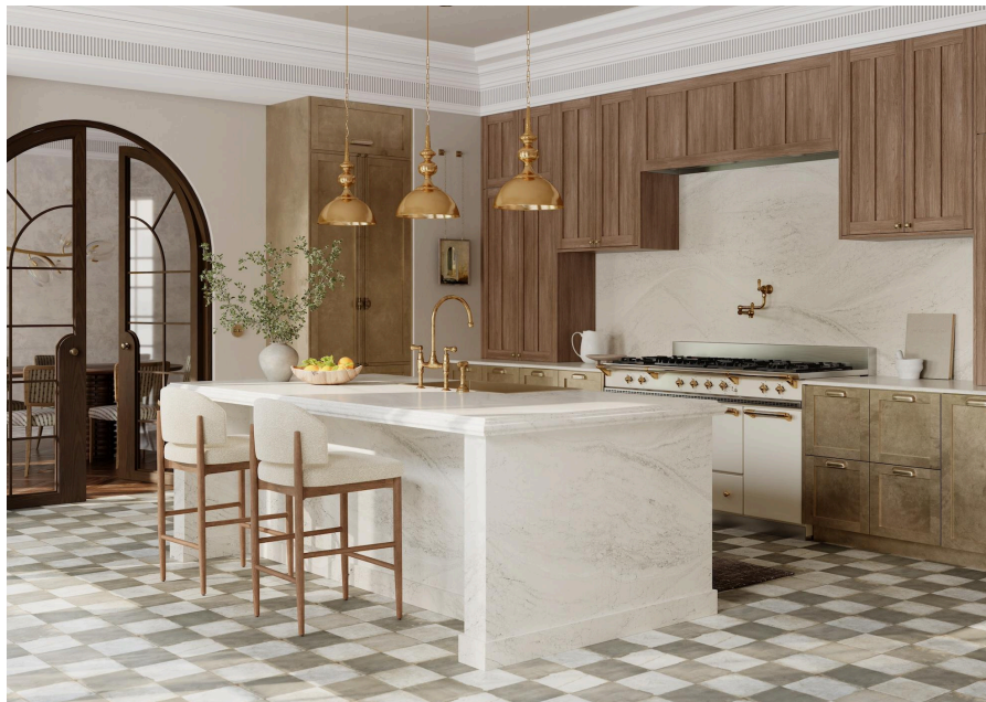
Cambria design shown: Claremont™