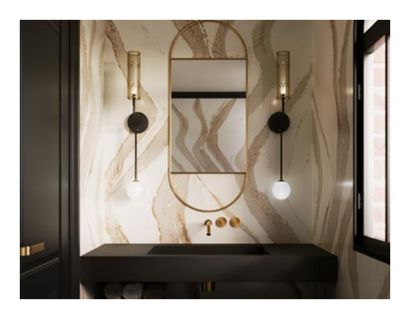
Brittanicca Gold Cool™.

Harlow™, inspired by the warm notes of chocolate brown, maintains an overall light and bright feel. It has a fully saturated, full coverage undulating veining structure that presents bold to soft gradation. The dark, warm brown is a trend that has been tracking since 2022 and is translating all over the US in different applications.