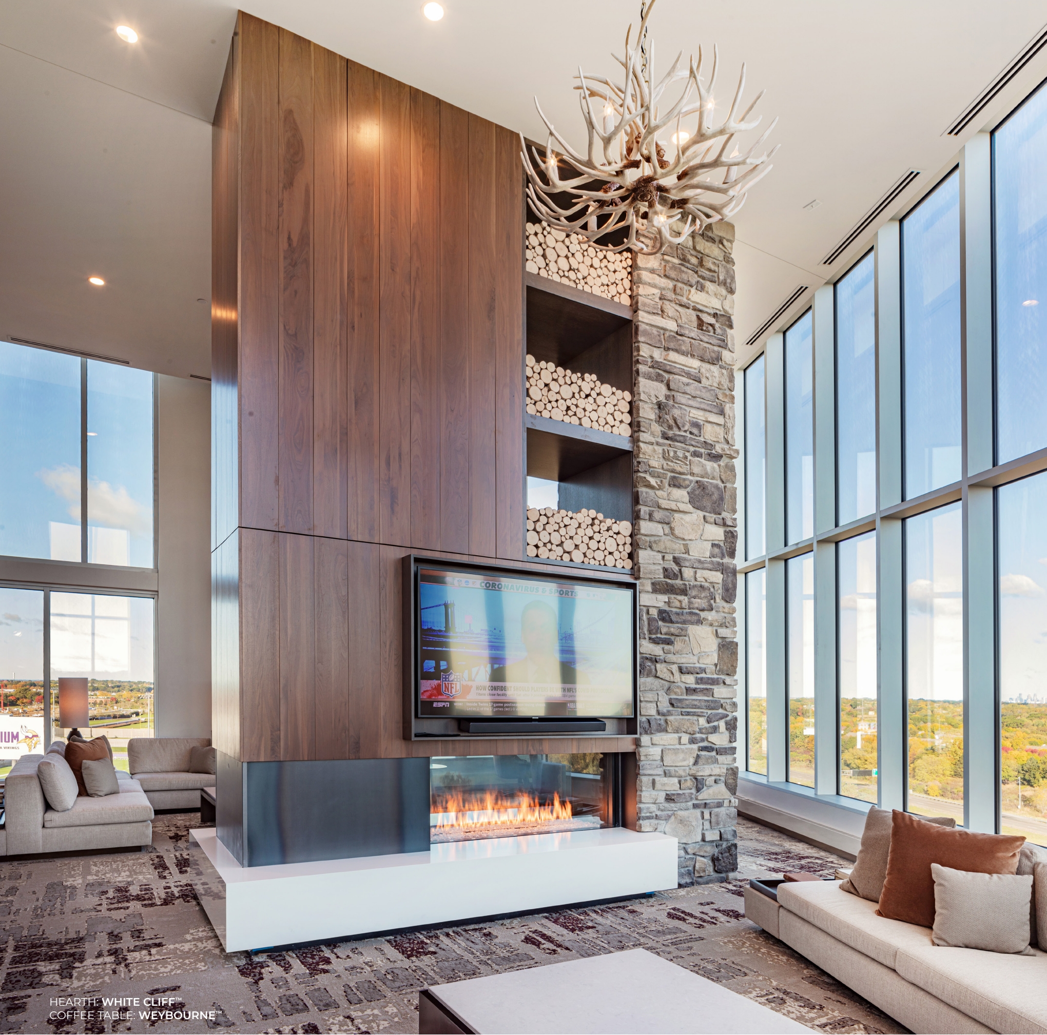
HEARTH: WHITE CLIFF™ COFFEE TABLE: WEYBOURNE™