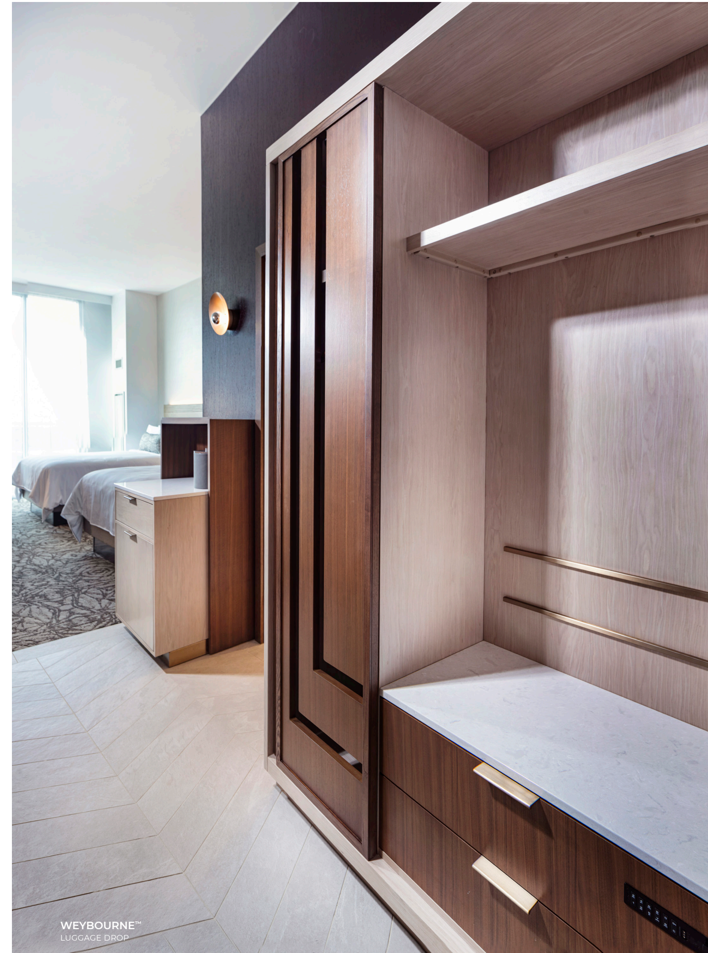
WEYBOURNE™ LUGGAGE DROP